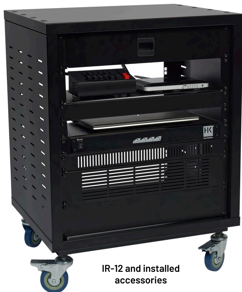
IR-12 and installed accessories